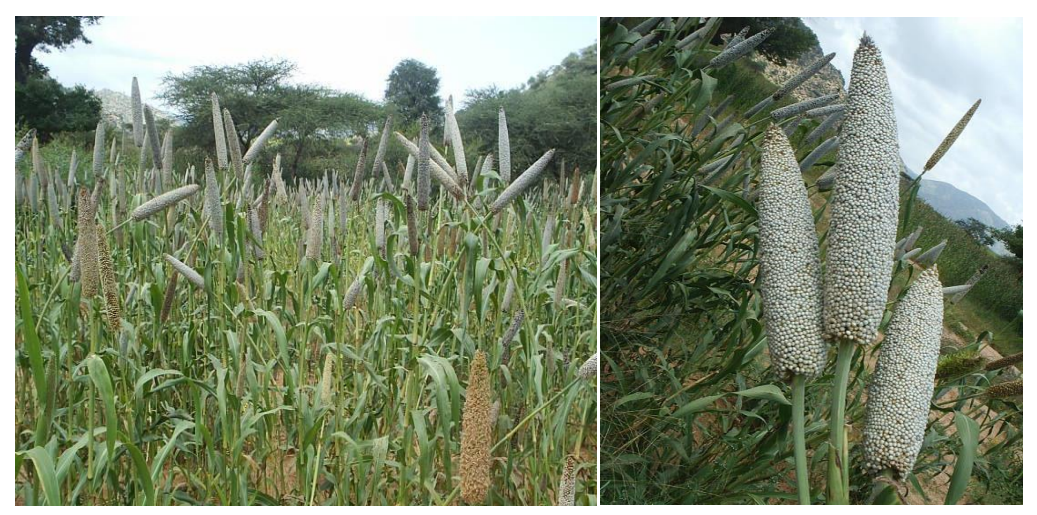
Figure 7: Kona/Hagaz pearl millet improved variety

Hagaz – well accepted by farmers; high yielder; resistant to downy mildew; crop residue low in biomass.