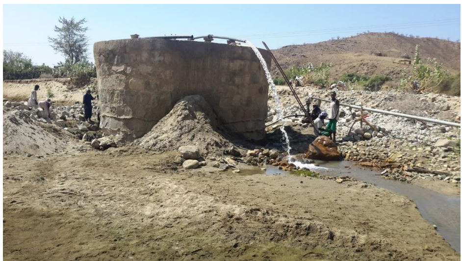
Figure 4: A well in Fiza

Water will be pumped from the wells to the reservoir using a solar set-up. Two solar pumps with a capacity of 7.5 kw each and 48 modules of 180-watt capacity with all accessories (switch board, inverter) have been fixed to generate power to pump water to a reservoir. Ten rolls of HDPE pipes having 90mm diameter and 100 m length have been buried underground. In addition, a total of 1000m pipes, 50 pieces of 3-inch diameter having a total length of 300 m, 10 rolls of 32 mm diameter having a total length of 100 m to be used as conduits for 700 m cables (with 35 m<sup>3</sup>) and 1000 m cables of 3.5 mm diameter have been placed underground. In order to protect the solar arrays from any damage and human interference a 144 m<sup>2</sup> of area has been fenced with mesh wire. When operational this irrigation system was providing a significant contribution in providing supplementary power to irrigate farms farther away from the diversion weirs and saving farmers the cost of fuel. The solar set-up can work for a maximum of 6 and ½ hours daily pumping about 50 m<sup>3</sup> of water. Main irrigation is from the diversion.