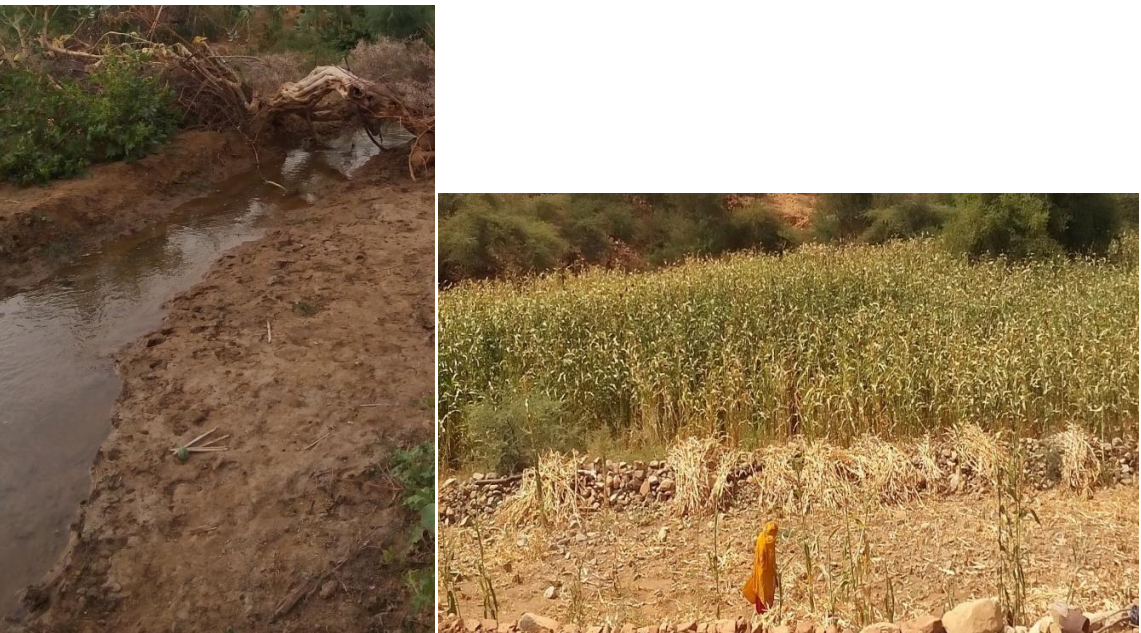
Table 13: Farmer-built diversion near Flfile (left) and sorghum produced from the diversion (right)

A good example of a lesson learned from the project was witnessed during the visit for the MTR. A farmer near Flfile diverted water from a tributary of Anseba River for supplementary irrigation of sorghum (Figure 13). The stand of the sorghum crop was much better than that of surrounding farmers who depended only on rainfall.