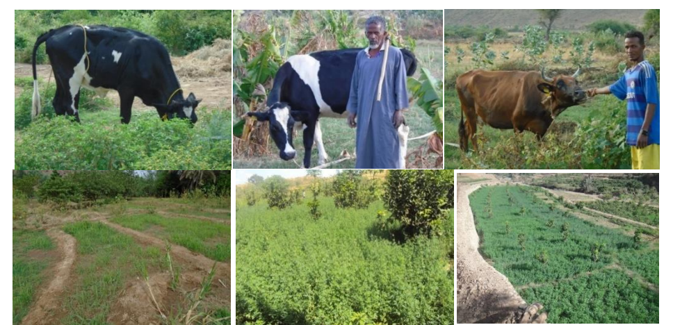
Figure 9: Dairy cows and forage development in the project area (minimum integrated agricultural package)

At Fiza water was first made available through the diversion system. Twenty-five model (progressive) farmers were selected. They were provided with ½ ha of land next to the diversion weir. Training was provided on dairy production, management and health care. Each farmer received an in-calf heifer or cow on condition that the farmer would give back a six-month old female calf to another farmer who had not received a cow through the project. The farmers were provided with seeds of alfalfa and pigeon pea and root cuttings of elephant grass to cultivate for animal feed. Each farmer had to construct a basic shelter (house) for the cow. The number of calves that have been transferred, mortalities, births, etc. is shown in Table 6. The feeds of the cows mainly consist of alfalfa and elephant grass and crop residues. The farmers also purchase sorghum grain to feed the cows at the rate of 2-4 kg per day. Average milk production per day is 5-8 litres.