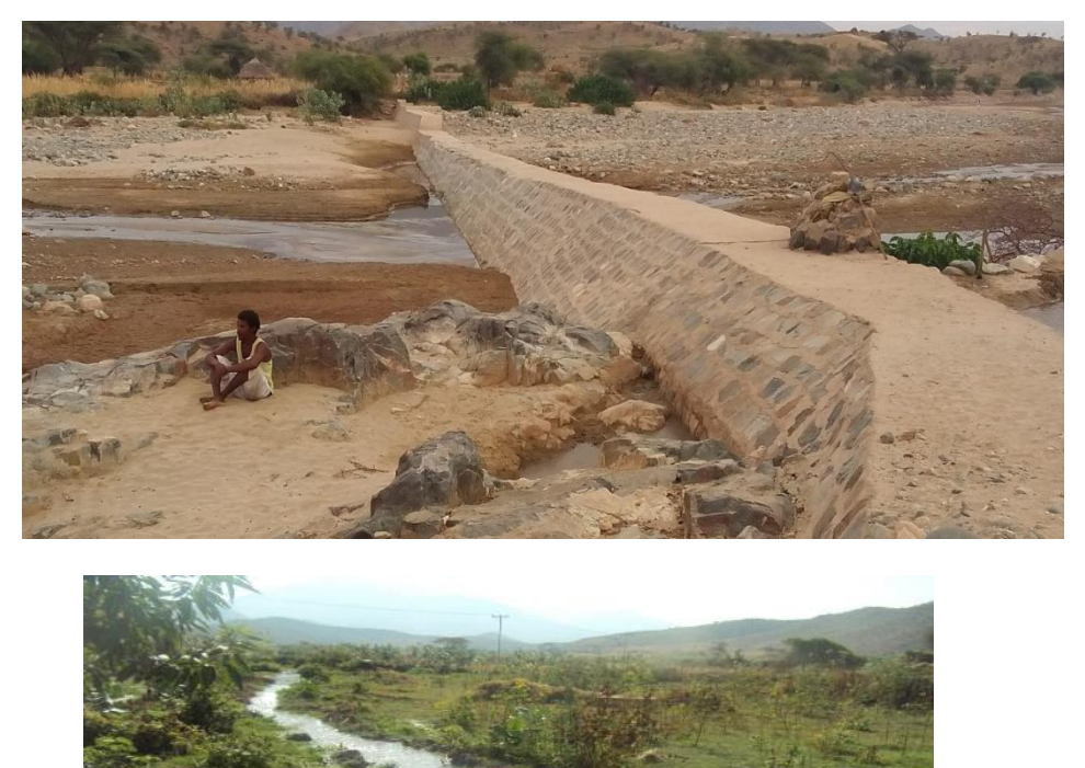
Figure 3: Diversion structures at Lemayt (Simit Heday), Sub-zoba Habero

At Fiza there are two wells that have been built by the MoA in 1998. With the current project, it was decided to make use of them to supplement water for irrigation in addition to the diversion. These