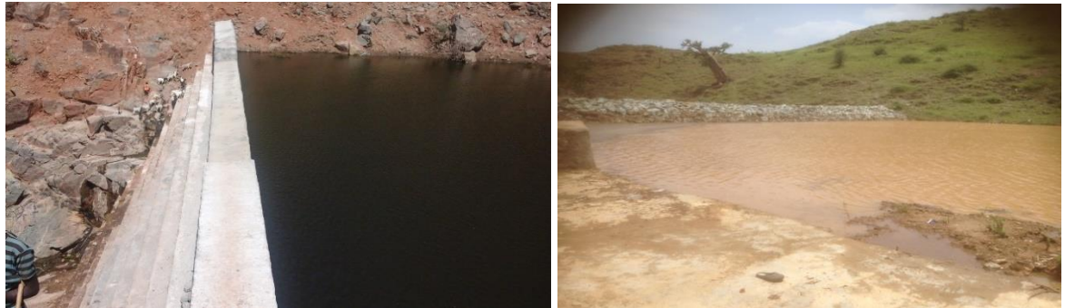
Figure 5: Micro-dams aat Wazntet (left) and Gebsi (right)

Two micro-dams have been constructed at Wazentet and Gebsi with a total capacity of 320,000 m<sup>3.</sup> Another micro-dam is being constructed at Shlilak (Basheri) as mentioned at 1.1. The construction of a micro dam at Wazentet was completed in 2013 and for the subsequent two years the dam contained water that lasted throughout the year. It provided the inhabitants of Wazentet and their livestock with security of water.