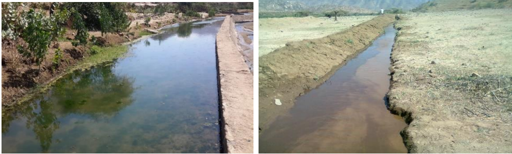
Figure 2: Diversion structures at Fiza, Habero Sub-zoba