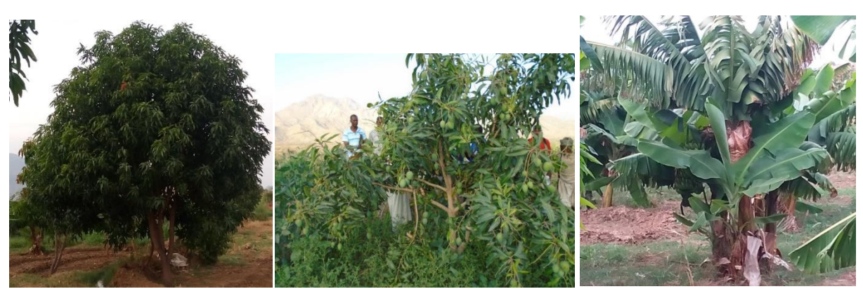
Figure 8: Mango (left and middle) trees and banana tree (right) in Fiza, Habero

A major part of the project consisted of selecting a total of 50 farmers, 25 each from Fiza in Habero and Musha Berdeg in Hamelmalo to be beneficiaries of a minimum integrated agricultural package of options that included the distribution of an in-calf-heifer, 25 chicks and a total of 100 bee hives.