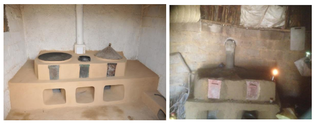
Figure 11: Energy efficient improved stoves (Mogogos)

Note: Appropriate use of the improved mogogos can be assured through continuous monitoring and checkup of the condition of the improved mogogos by the trained women and extension agents of MoA. Improved mogogos have been introduced more successfully in many villages in other zobas with a more critical shortage of firewood (such as in Mae'kel) than in the sub-zobas of Habero and Hamelmalo. More effort is required by extension agents of the Project to raise awareness of the benefits of the improved mogogos so that they are used more efficiently.