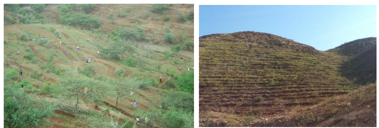
Figure 6: Enclosure in Hamelmalo planted with Sisal and Acacia Senegal

Hillside terraces and check dams were constructed along contours using stone and soil in Habero and Hamelmalo sub-zobas (Table 1). In 2016, the hillside terraces constructed in Habero and Hamelmalo were 96,326 m and 175,020 m, respectively. About 25 ha of enclosure has been established in Aretay with hill side terraces constructed in it. However, due to the severe drought of 2015 the enclosure was not protected from grazing by all livestock. In 2016, with better rains, the enclosure is being revived. It would be a good idea to reserve 5-10 ha of this enclosure for the establishment and regeneration of indigenous grasses to be used as a source of seeds. Similarly, in Hamelmalo 25 ha of hillside terracing and check dam have been constructed and planted with 60,000 seedlings of sisal and 26,204 seedlings of Acacia senegal in June 2016. The condition of the enclosure during the visit for the MTR was excellent with more than 90% of transplanted seedling established (Fig.6). The enclosure is guarded by the community.