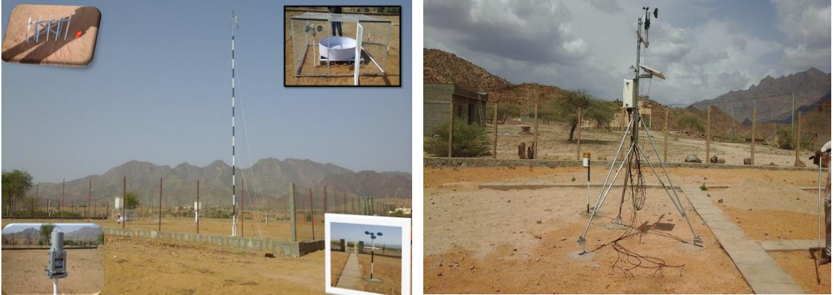
Figure 12: Class1 Manual weather station at HamImalo Agricultural College/Hamelmalo (left) and Class1 Automatic weather station at Habero (right)