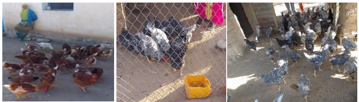
Figure 10: Result of successful chick distribution in Hamelmalo and Habero

The aim of distributing the chicks was to help needy women (female-headed households). As explained, there was significant mortality of the distributed chicks. Adequate training on poultry feeding, management, and health care and regular follow-up by extension agents would have minimized the mortality on time. Provision of older than one-month old chicks would have reduced the mortality because most of the mortalities took place the first few days after they were distributed. Older chicks would have better resistance and ability to run away from predators.