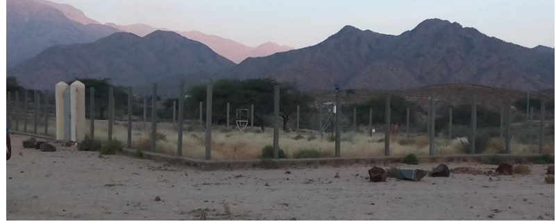
Figure 13: Class1 Weather station at Aretay